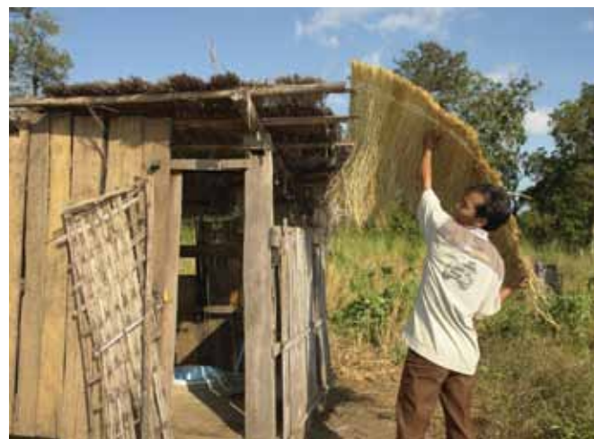
Water and Sanitation Program ( www.wsp.org )

O utput-Based Aid (OBA) ties the disbursement of public funding to the achievement of clearly specified results that directly support improved access to basic services. OBA has emerged as an important way to finance access to basic services, but experience with OBA approaches in the sanitation sector has remained limited and there have been mixed results. Evidence from existing projects suggests that OBA could improve the targeting and efficiency of subsidy delivery, and help to develop and strengthen sanitation providers. OBA subsidies could be packaged to support services along the “sanitation value chain,” from demand promotion to collection/access, transport, treatment, and disposal/re-use. OBA approaches for sanitation are no panacea, however, and they need to go hand-in-hand with broader reforms in the sanitation sector.