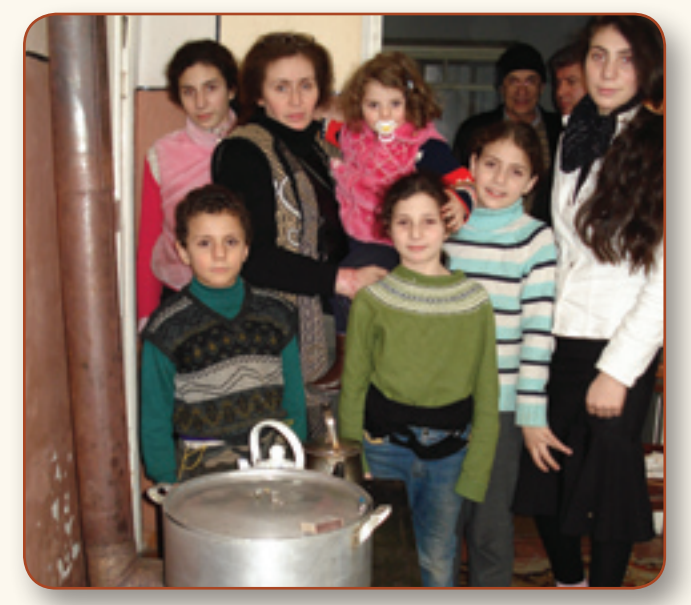
An OBA scheme in Armenia limits eligibility to the poorest and most vulnerable, using "poverty scores" assigned by the government's Poverty Family Benefit Program to identify beneficiary households.

promised: the definition of "outputs" includes quality parameters and in some cases even services that extend out for several years, such as maintenance of and parts supply for solar home systems, to help ensure a certain degree of quality and sustainability.