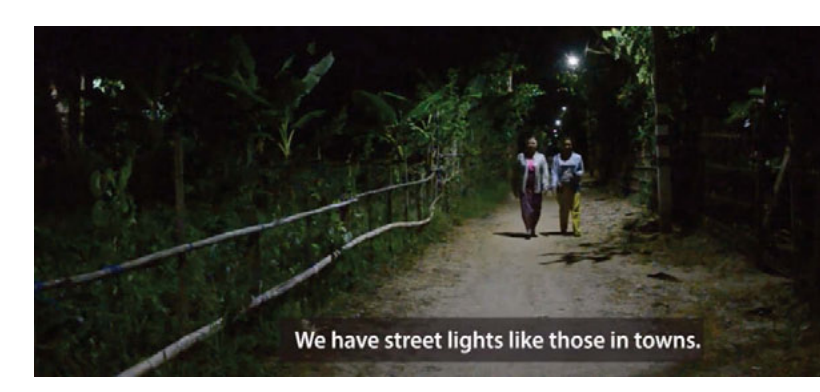
Lighting the Way for Growth in Rural Myanmar— Agriculture.

So far, 85 mini grids have been approved, mostly solar. Of these, 37 are already operational—developed by local and international entrepreneurs—providing 24-hour reliable electricity to rural households, enabling income-generating activities, clean water provision, improved health and education services, and street lighting. Women are benefitting from better social services, increased safety, improved communication, and new entrepreneurship opportunities. In the context of Covid-19 pandemic, the mini grid developers engaged local communities in the distribution of soap, protective equipment, and hand sanitizer, while also providing tariff discounts and donations. Displacing polluting diesel generators, these mini grids have also contributed to a reduction of greenhouse gas emissions by 93.9 ktC carbon dioxide equivalent.